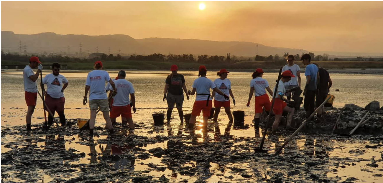
Local communities engaged in the creation of artificial islets for bird nesting in the Saline di Priolo (Sicily), as part of restoration activities undertaken in more than 25 sites around the Mediterranean.

The first phase of MedIsWet was to find out the scale of the task, and a complete inventory of all island wetlands in the Mediterranean revealed a total of more than 15,000 sites. Now, MedIsWet is involved in a range of wetland restoration projects in critical sites on islands across the Mediterranean. Working on all kinds of island wetlands from Greece to the Balearic Islands, MedIsWet is convening stakeholders, building expert networks, sharing best practices, and raising public awareness about why wetlands matter and what we need to do to save them.