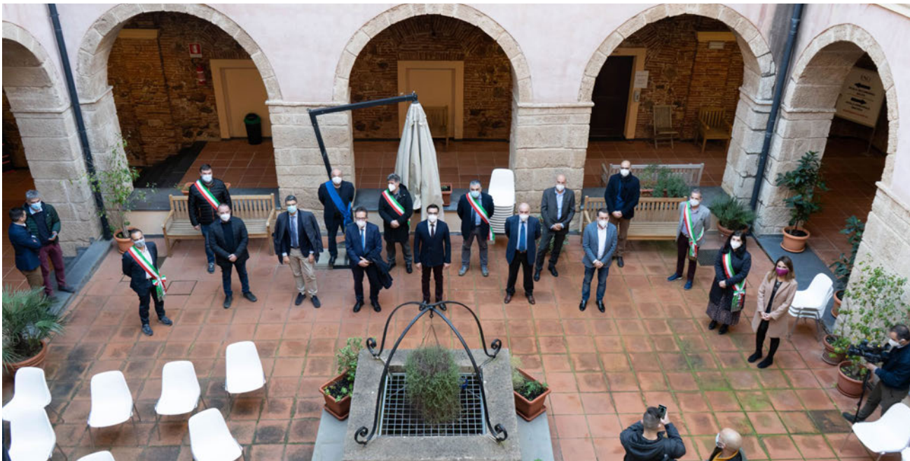
During the World Wetlands Day 2021, 11 municipalities and 3 authorities celebrated the signature of the Maristanis Coastal Wetland Contract (MCWC) in a ceremony in the historic buildings of Oristano University.

To meet this need, eleven municipalities and three other authorities decided to undertake an integrated and shared approach to governance through the Maristanis Coastal Wetland Contract. This consists of a voluntary agreement on the shared management of wetland ecosystems through which private and public sector actors jointly promote and safeguard wetlands through nature-based solutions that deliver pollution reduction, habitat restoration, and climate adaptation. It also forms the basis for the new Parco Regionale delle Terre d'Acqua dell'Oristanese.