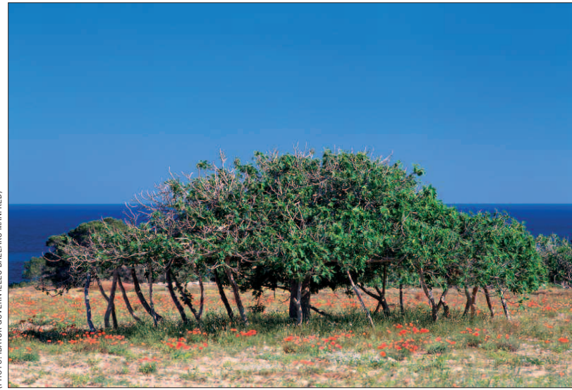
Left to right: European fan palm ( Chamaerops humilis ), Yellow asphodel ( asphodeline lutea ) and Fig ( Ficus carica )

Arbutus unedo , Erica arborea and Quercus coccifera , and phrygana composed of spiny, hemispherical dwarf shrubs ( Anthyllis hermanniae , Coridothymus capitatus , Euphorbia acanthothamnus ...). Woodlands are mainly composed of sclerophyllous trees at low to mid altitudes ( Ceratonia siliqua , Phillyrea latifolia , Quercus ilex , Quercus coccifera ) with Pinus brutia , whereas deciduous oaks ( Quercus brachyphylla , Q. ithaburensis subsp. macrolepis ) occur nowadays only as scattered trees. In mountain areas, Acer sempervirens and Cupressus sempervirens are the dominant trees with Quercus coccifera ; one of the most interesting trees is Ambelitsiá ( Zelkova cretica ), a relict elm-like tree present sparsely in the western mountains between 850 and 1800 metres.