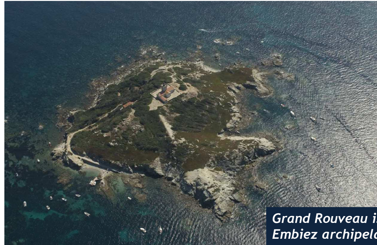
Grand Rouveau island Embiez archipelago Var - France